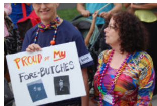
Down the Rabbit Hole