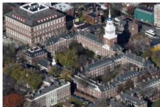
Such Sweet Kisses