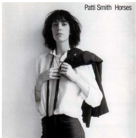
Horses album cover with Mapplethorpe's iconic photo of Patti Smith

Mapplethorpe was fascinated by Times Square, which he called "the Garden of Perversion." Upon seeing