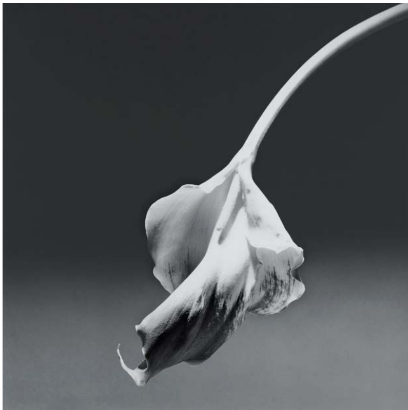
Robert Mapplethorpe, "Calla Lily," 1986. Gelatin silver print, Solomon R. Guggenheim Museum, New York. Gift, The Robert Mapplethorpe Foundation.