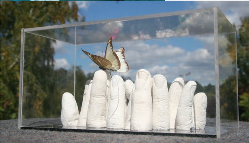
Parente Plexiglass. A delicate bouquet of 18 male fingertips cast from life, with butterfly, 1982.