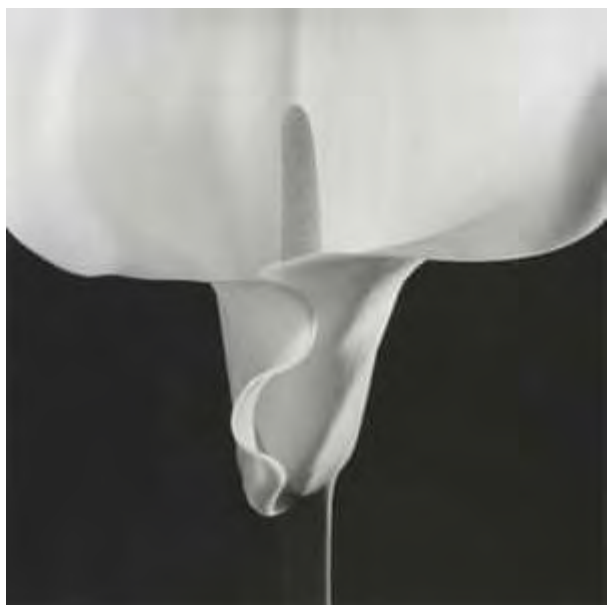
Calla Lily, 1988

beauty time-lapsed fast into the stoic beauty of the dying, he did not like eyes looking back at him through the camera. So he shot flowers and statues and objects that obeyed his direction and made no demands.