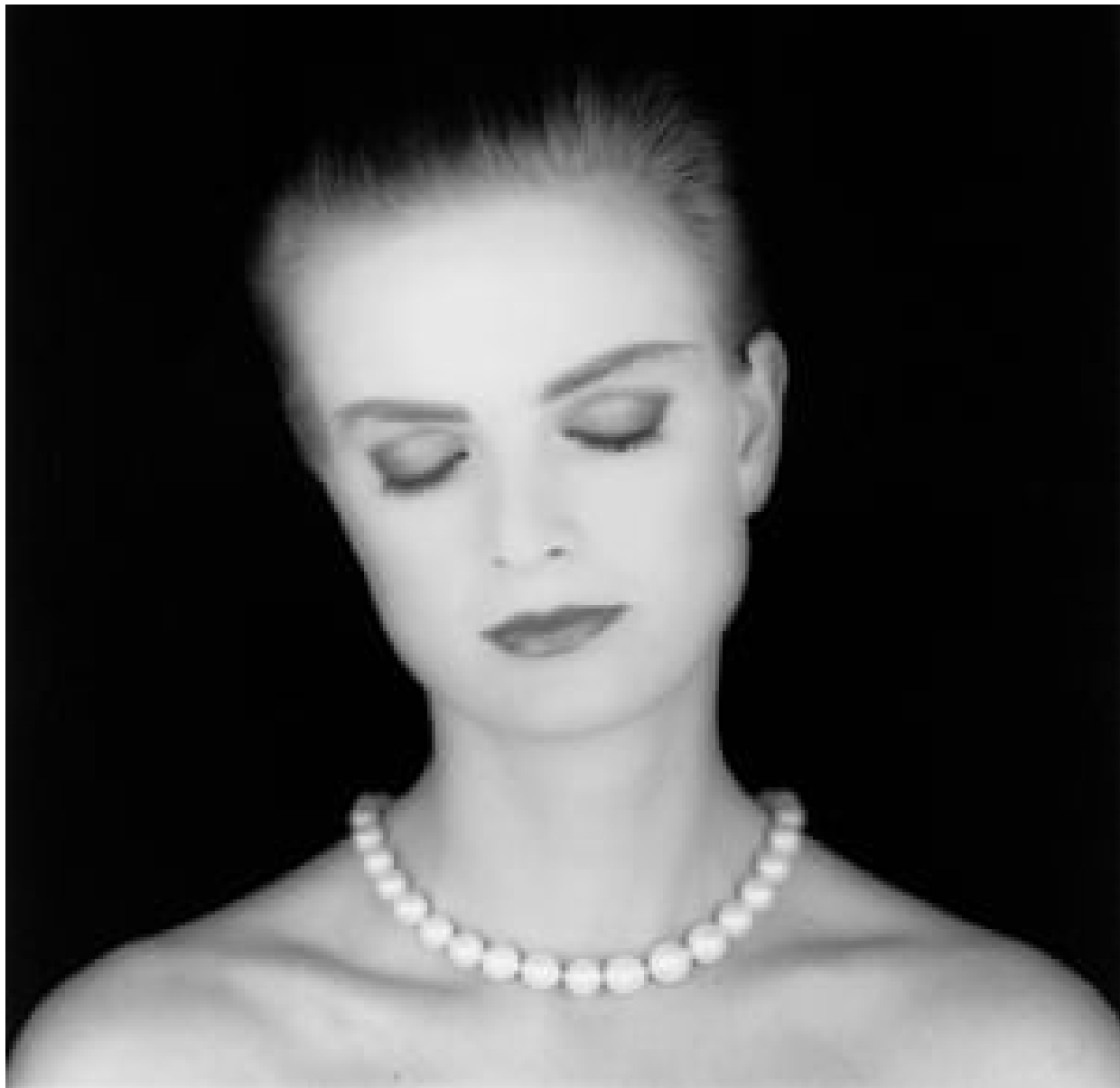
Princess Gloria Von Thurn und Taxis, 1984