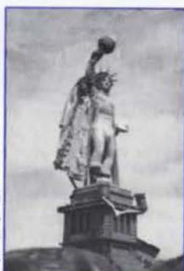
The March on Washington. Liberty was "exposed".